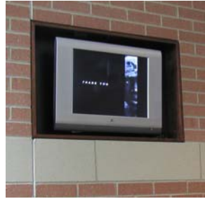
Flat Panel Displays