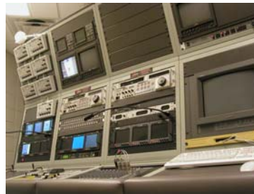
Master Control Console